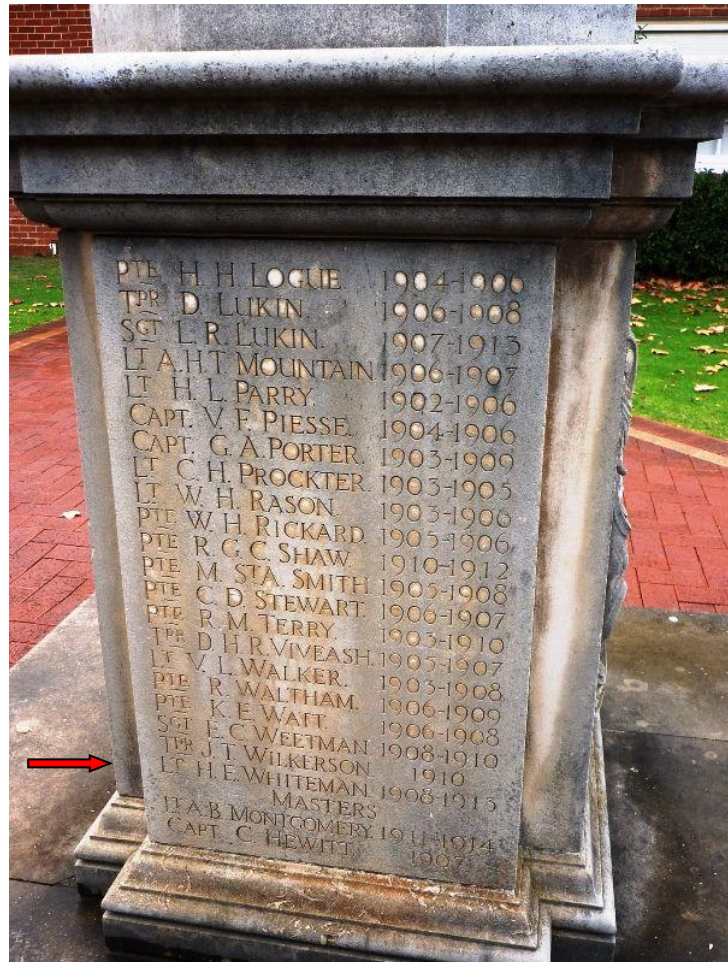
Old Guildfordians War Memorial