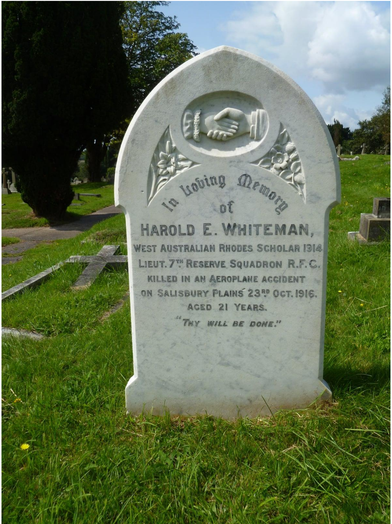
Photo of Second Lieutenant Harold Ernest Whiteman's Private Headstone in Bexhill Cemetery, Bexhill-on-Sea, East Sussex, England.