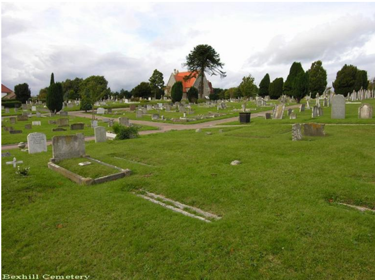
Bexhill Cemetery