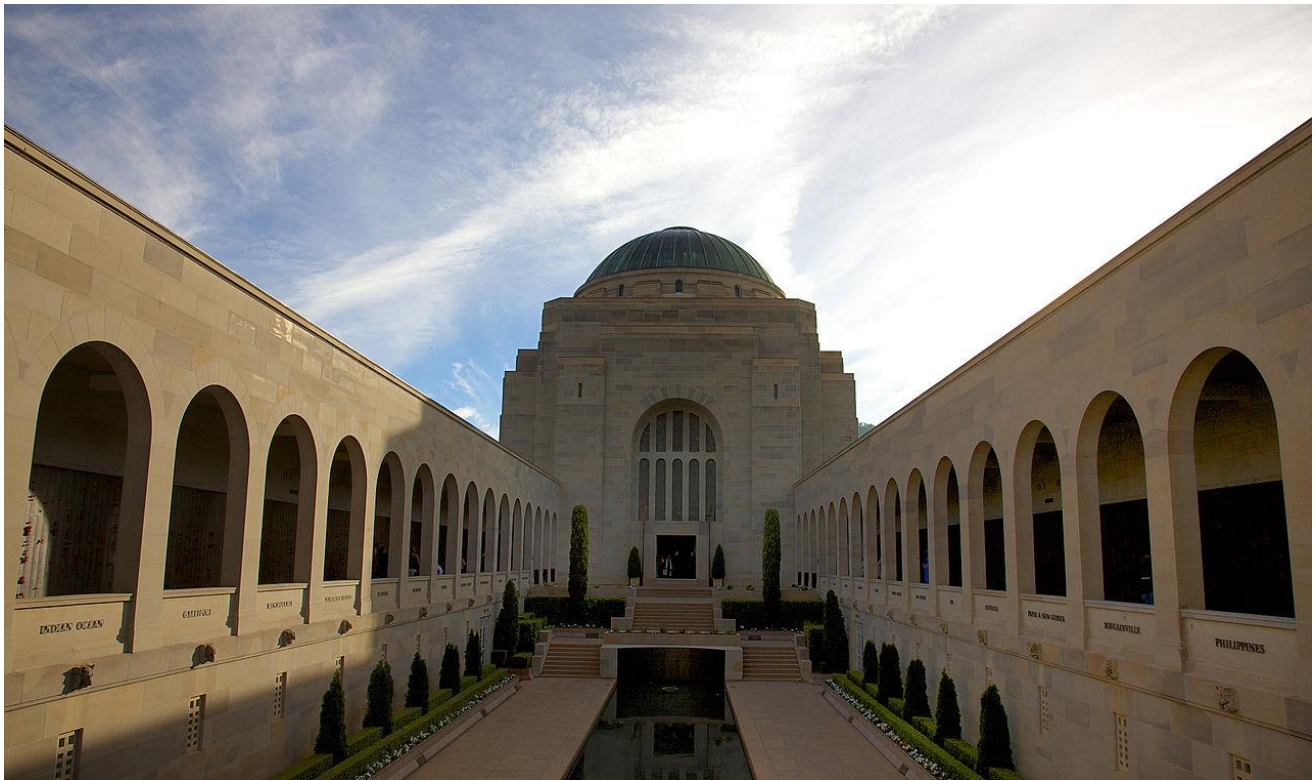
Commemorative Area of the Australian War Memorial