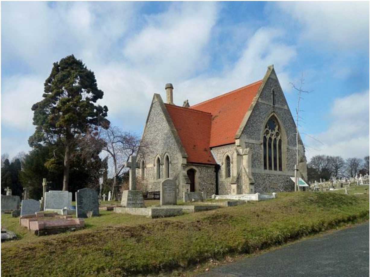
Chapel in Bexhill Cemetery